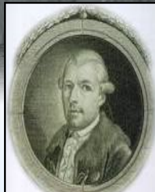
Illuminati founder Adam Weishaupt

*Note: In the year 1776, a man named Adam Weishaupt started a secret society called the Illuminati. The word means “enlightened”. Weishaupt’s enlightenment came from his study of the mystical religions of Egypt and Babylon, which tells that his inspiration was from Satan and not God. This group enlisted many wealthy people from Europe, one of them being banker Mayer Rothschild. As the order grew into power, it almost took control of all Europe until they were exposed and banned by Karl Theodor in 1785. Their ultimate goal was to bring about a NEW WORLD ORDER where a hand full of elite men would control the governments and churches of society.